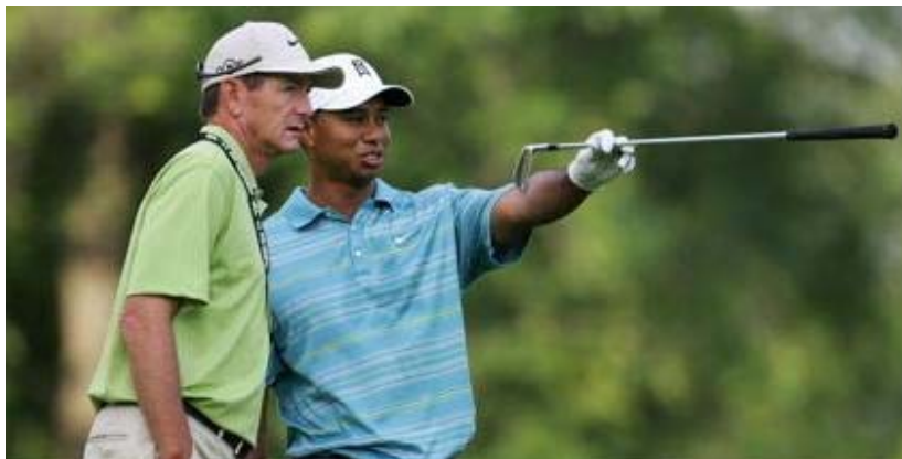
Tiger Woods with his coach Hank Haney

No doubt, Tiger Woods is one of the most successful golfers of all time. Currently the World No. 1, he was the highest-paid professional athlete in 2007, having earned an estimated $122 million from winnings and endorsements. The golfing phenomenon attributes much of his current success to the regular work he does with his personal coach, Hank Haney. Tiger has been coached by Hank since 2004 and Tiger's success has increased remarkably due to a different golf swing and a different philosophy taught by Hank. "You need to have more of a plan where you are going, what you are trying to do, how you are practicing, how you are going about trying to improve" Hank said. In fact, he points out a clear plan that takes you from A to Z what should be formed with the help of a coach. He added: "Tiger is the student of everything that he has to do with getting better."